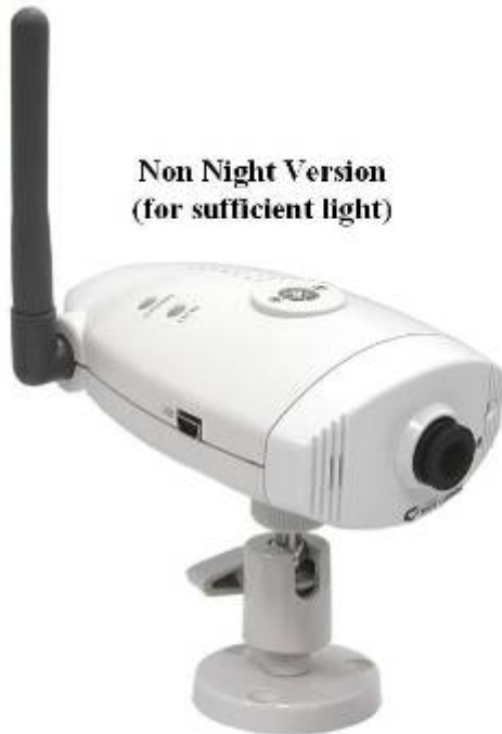
Non Night Version (for sufficient light)

Model 2: IP CAM + PC CAM + Wi-Fi CAM + DIVX Movie Capture