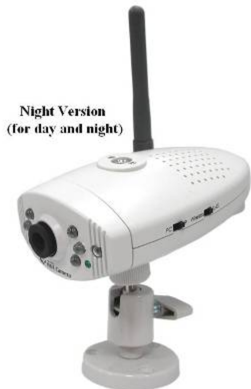
Night Version (for day and night)