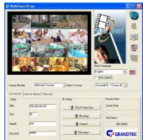
Surveillance Software: WalkGuard 7.0 (model 2)