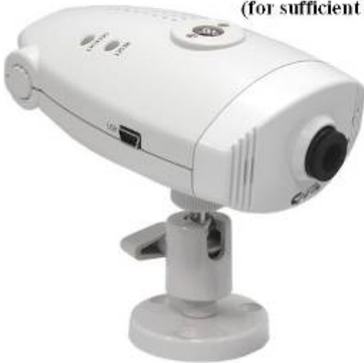
Non Night Version (for sufficient light)