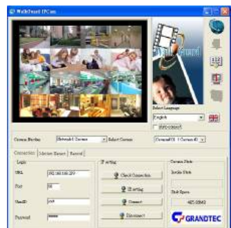
Surveillance Software: WalkGuard 7.0 (model 2)